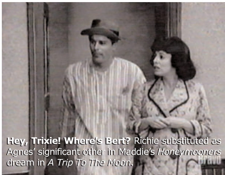
Hey, Trixie! Where's Bert? Richie substituted as Agnes' significant other in Maddie's Honeymooners dream in A Trip To The Moon .